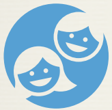
CHADWICK MINIS Ages 4 and 5 (as of June 1, 2018)