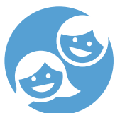
CHADWICK MINIS Ages 4 and 5 (as of June 1, 2018)