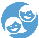
CHADWICK MINIS Ages 4-5 (as of June 1st, 2022)